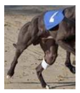
The left hind leg may be taped to prevent tibial periostitis (track leg) due to the impact of the tibia against the elbow